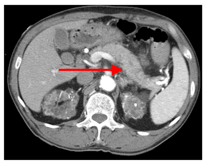
Figure 2: A 57-year-old man with polycystic kidney disease, endstage renal disease, coronary artery disease, and bronchiectasis presented with refractory and massive hemoptysis. Ten hours after transarterial embolization, acute epigastric pain occurred, and contrast-enhanced computed tomography of the abdomen revealed mild swelling with blurred contours at the pancreatic body, suggestive of acute pancreatitis (red arrow).

hemoptysis, the control rate achieved through bronchial artery embolization exceeds 90%.[4] A meta-analysis summarized the complication rate of bronchial artery embolization as 13.6%, with most complications being self-limited, including fever,