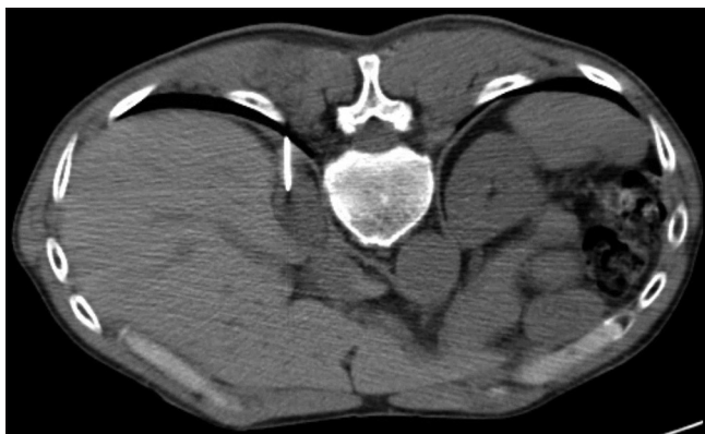
Figure 2: A 65-year-old male with metastatic squamous cell carcinoma. Axial non-contrast-enhanced computed tomography demonstrates a biopsy needle within the right adrenal lesion