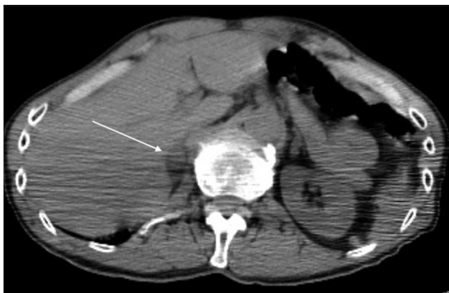
Figure 1: A 65-year-old male with metastatic squamous cell carcinoma. Axial non-contrast-enhanced computed tomography demonstrates a soft tissue lesion in the right adrenal gland (white arrow)

Many disease processes require tissue diagnosis before appropriate treatment. Conventionally, tissue was acquired through incisional or excisional biopsy. An incisional biopsy results in removal of a portion of the lesion for testing,