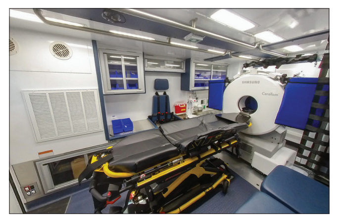
Figure 1: A standard interior of a mobile stroke unit. Note the presence of standard ambulance equipment, a computed tomography scanner, and point-of-care laboratory equipment.

As has been discussed, stroke care is extremely time sensitive, lending itself to the mantra, "time is brain." Once a patient arrives at a stroke center, care can be streamlined to expedite the delivery of personalized, evidence-based stroke