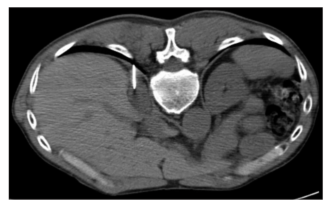
Figure 2: A 65-year-old male with metastatic squamous cell carcinoma. Axial non-contrast-enhanced computed tomography demonstrates a biopsy needle within the right adrenal lesion

Dickinson and Company, Franklin Lakes, New Jersey, USA). Three core samples were obtained. The results were consistent with poorly differentiated squamous cell carcinoma.