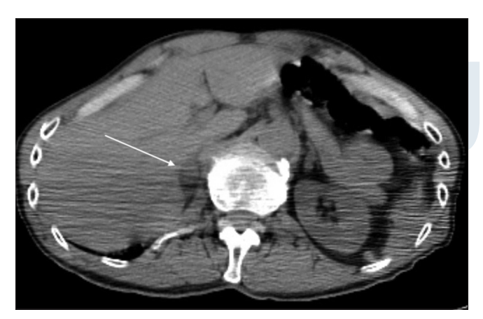
Figure 1: A 65-year-old male with metastatic squamous cell carcinoma. Axial non-contrast-enhanced computed tomography demonstrates a soft tissue lesion in the right adrenal gland (white arrow)

Approximately 1 week later, the right paraspinal muscle lesion was biopsied under ultrasound guidance (Figure 4) using an 18-gauge Temno Evolution biopsy gun (Becton,