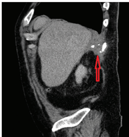
Figure 1: A 64-year-old male with surgical history of cholecystectomy found to have a post-operative abscess and a sinus tract with multiple calcified gallstones in the right flank. Contrast-enhanced computed tomography of the abdomen and pelvis, sagittal view reveals a post-operative abscess and multiple calcified stones in the posterior right upper quadrant (arrow).

Ultra Stiff Wire Guide 0.035" × 80 cm (Cook, Bloomington, IN), was advanced beyond the stone so the stiff body of the wire could support the sheath [Figure 2b]. The needle was removed, serial tract dilation was performed over the wire, and a sheath, 18F × 40 cm Cook Check-Flo Performer introducer sheath (Cook, Bloomington, IN), was advanced to the stone. An endoscopy basket, 2.4F × 120 cm Boston Scientific Segura Hemisphere Stone Retrieval Basket (Boston Scientific, Marlborough, MA), was advanced through the sheath and was successfully deployed to grasp the stone [Figure 2c]. The sheath was removed and the stone was sent to pathology, confirming a simple bile stone. At 3-week follow-up, the wound was completely healed and the patient's symptoms had resolved. No repeat imaging was performed (See supplemental data: Timeline of events).