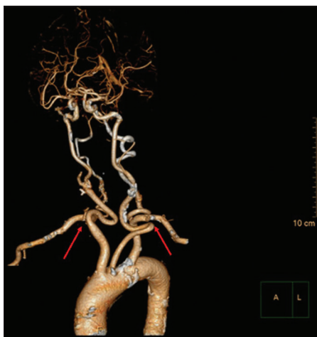
Figure 1: An 84-year-old woman who presented with the left arm and leg weakness diagnosed with the right anterofrontal lobe and left hemispheric lesions secondary to internal carotid artery stenosis. Bilateral tortuous common carotid arteries were demonstrated on computed tomography angiography during surgical planning and later with 3D reconstruction, seen above.

Five months later, she was referred to our clinic for second opinion of TCAR. Considering her high-risk surgical status and atypical anatomy, further surgical intervention was deferred in favor of continued medical management. Unfortunately, 1 month later, she presented with recurrent transient ischemic attack symptoms due to the right anterofrontal lobe and left hemispheric lesions. On computed tomography (CT), her right carotid artery plaque had high-risk morphology, placing her at risk for ipsilateral stroke without surgery. A CTA of the neck showed tortuous bilateral CCAs [Figure 1], complicating an endovascular approach. Reoperative CEA under general anesthesia was excluded as an option given her intraoperative PEA arrest 7 months prior.