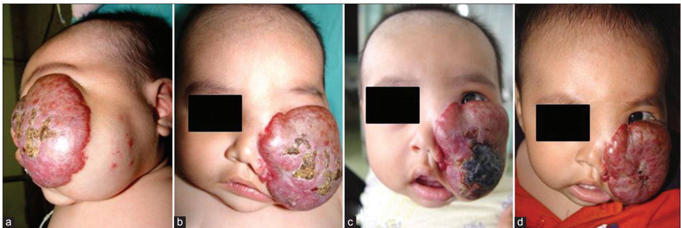
Figure 1: Case 1 — A 6-month-old male with a large congenital hemangioma involving the left nasogenian groove and part of the cheek, occluding the visual axis. (a and b) Patient's aspect before transarterial embolization. (c) Two weeks after 65% devascularization. The lesion became partially necrotic, and early shrinkage of the tumor, which cleared the visual axis, was observed. (d) Follow-up 5 months later showed partial involution of 40%. Patient was sent to head-and-neck surgery.

Even given the absence of complications in our four patients, we must emphasize that selective arteriography and super-selective micro-catheterization is difficult in infants whose vessels are short, thin, and prone to arterial spasm, dissection, and thrombosis. TAE in POIHs should be performed with extreme caution because it can result in serious and potentially fatal complications and, therefore,