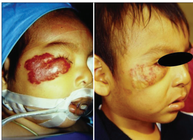
Figure 3: Case 3 — Pre- and 6 months' post-embolization of a 14 months old male with a superficial hemangioma of the right malar region and lower eyelid that caused palpebral closure with potential amblyopia. One month after transarterial embolization, the eye aperture was freed. Clinical picture 6 months later showed conspicuous tumor regression. The patient was sent to plastic surgery to consider skin grafting.

should be done only by trained teams. [33] External-internal arterial-arterial anastomoses are open in babies and children and embolic material can migrate to the retina and the brain. Injections of corticosteroids and sclerosing agents can thus occlude the ophthalmic and central artery of the retina, producing infarction with amaurosis and/or skin and eyelid necrosis. [34,35]