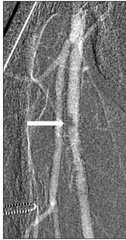
Figure 2: 63-year-old man with chronic kidney disease and atherosclerosis presenting with non-healing right toe ulcers and rest pain due to infrapopliteal arterial occlusive disease, who underwent endovascular revascularization via antegrade SFA access with Angio-Seal closure. Carbon dioxide digital subtraction angiography of the right thigh immediately after Angio-Seal deployment demonstrates a discrete ovoid eccentric filling defect in the proximal right SFA at the earlier puncture site.

one was detected incidentally on ultrasound 45 days later. All were successfully treated with percutaneous thrombin injection (Grade B).